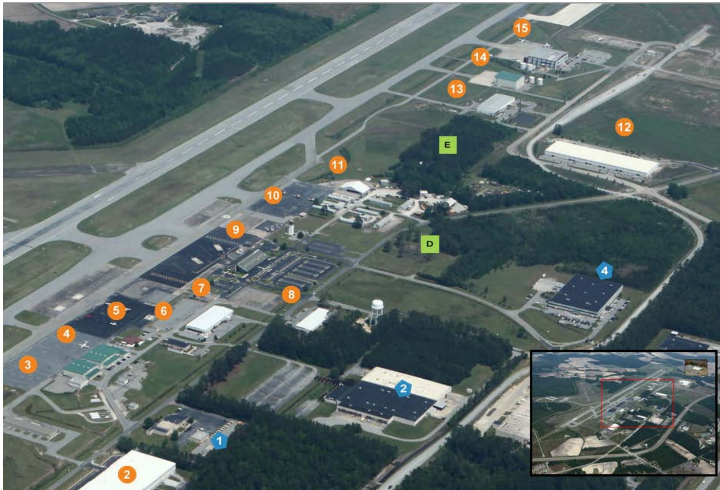
Exhibit 1: Map of Global TransPark