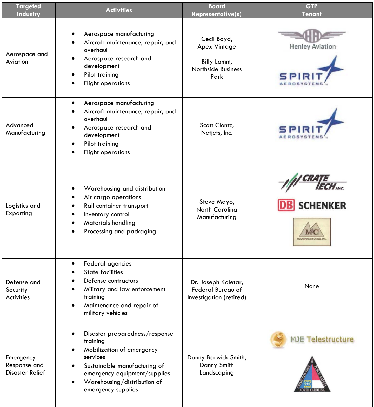
Exhibit 2: Global TransPark Authority Governing Board Includes Participation From Targeted Industries