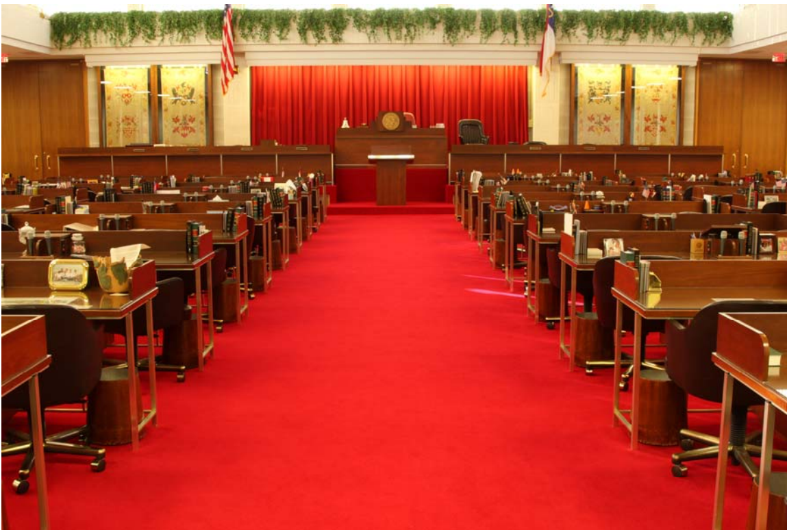
The House Chamber