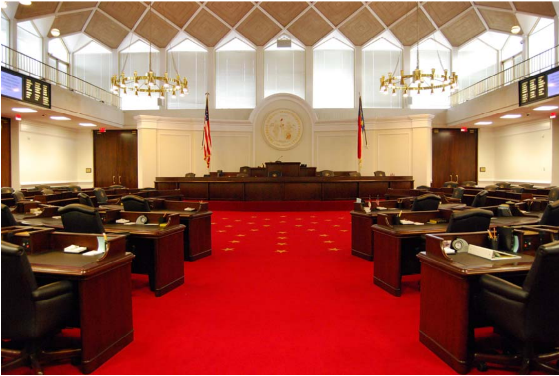
The Senate Chamber